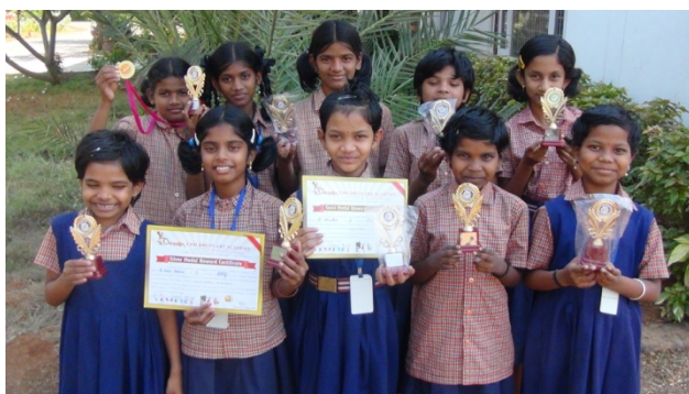
With Prizes won in Hand-writing Competition at School